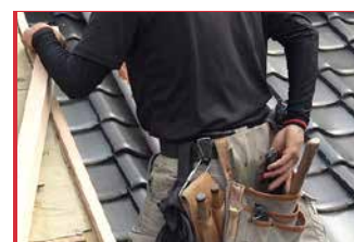
Folding system for better portability

Compact folding saw with combination teeth for Cross+Rip+Slant cutting plywood, laminated wood and various solid woods.