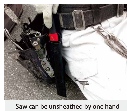
Saw can be unsheathed by one hand