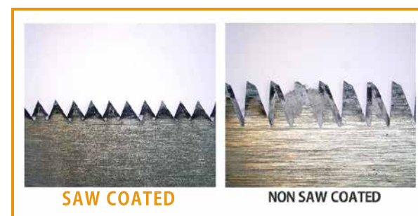
SAW COATED NON SAW COATED