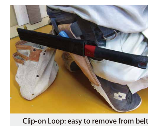
Clip-on Loop: easy to remove from belt