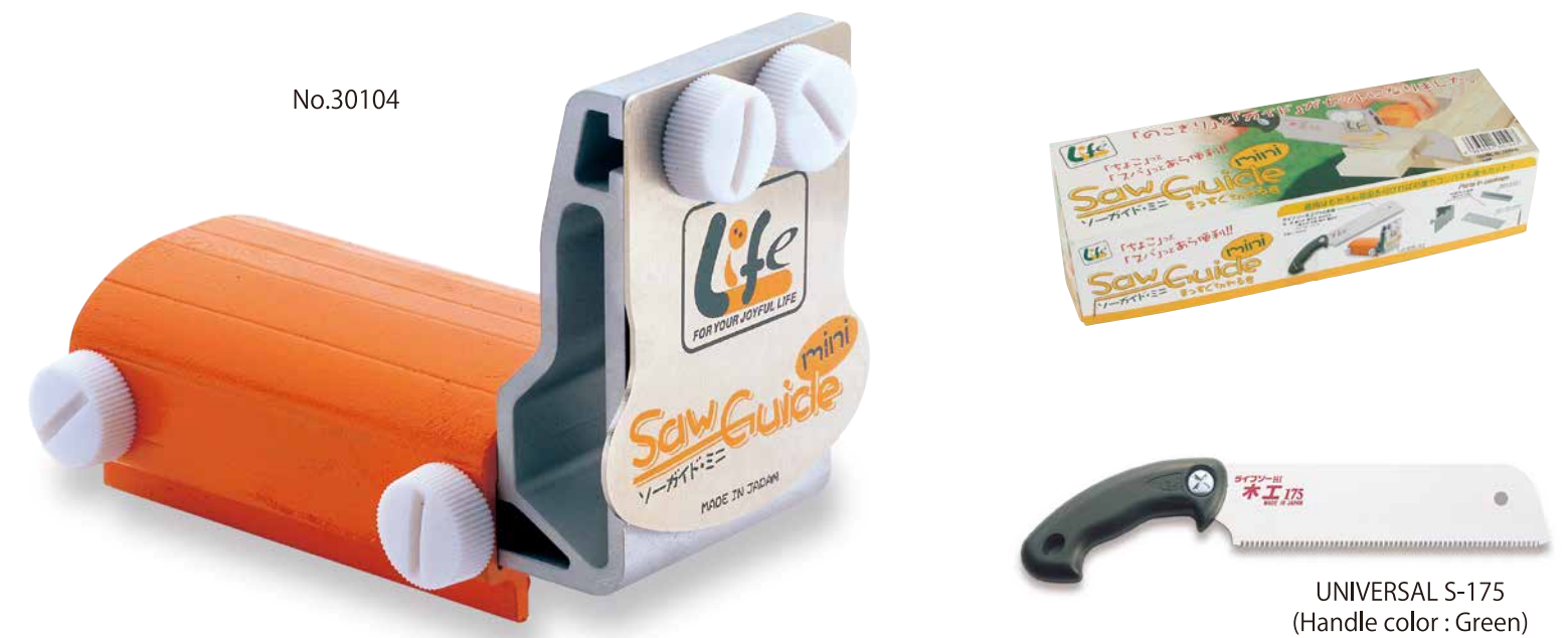
UNIVERSAL S-175 (Handle color : Green)