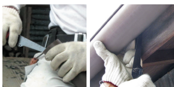
back blade can be used for deburring contour line