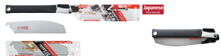
common blade with HANDY H-200 DAIKUME